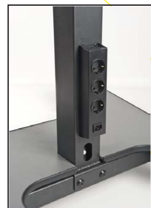
3 pole socket plug