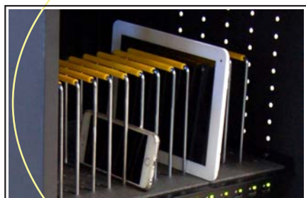
Separators for organized storing