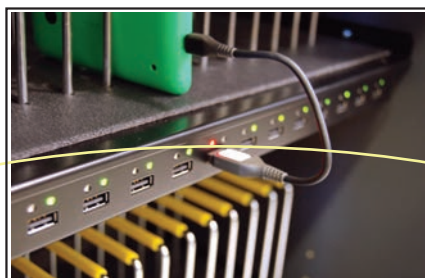
Unit during charging