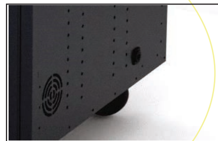
LAN connector as router access point