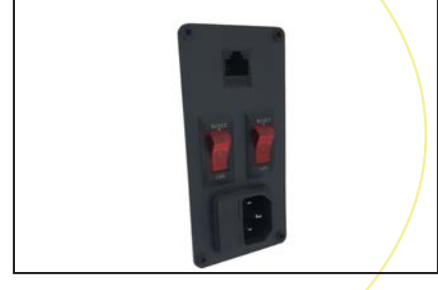
Main control board