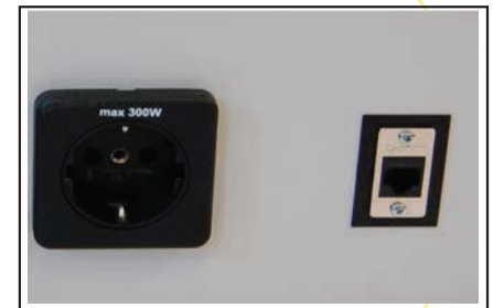
LAN connector as router access point